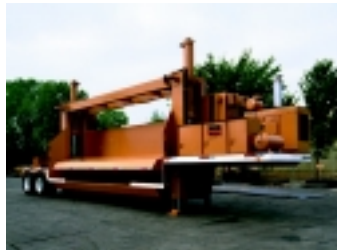
00:10 — Cylinders moving into place