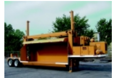
The result: 00:42 — QS lid fully open, 42-second setup!

In making these changes, we also kept in mind what's important to you. As a result, we still maintain both our 90-inch opening and our legal weight. Let the Big MAC QS get you up and running faster than ever before.