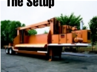
00:00 — QS at rest