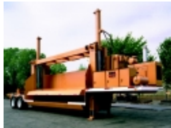
00:27 — QS with cylinders locked